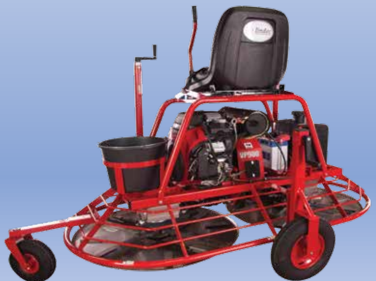
Picture shows machine with optional Dolly Wheels.

The machine is CE certified and follows all safety requirements of machine directives according to 2006/42/EG and AFS 2008:3.